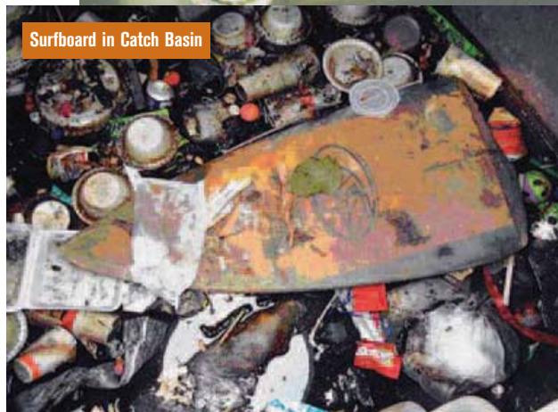
Surfboard in Catch Basin